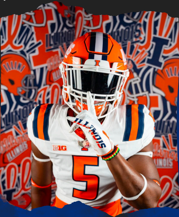
1 year Potenza player